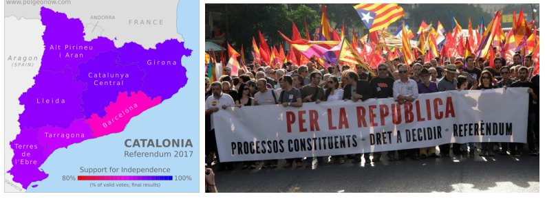
Fig. 1: High support for Catalonian independence during the 2017 referendum paralleled the use of Catalan slogans ( per la republica "for the republic") in protests.<sup>1</sup>

A person's attitude toward a particular topic can result in consistent patterns in their language choice : in political discussions, the use of a minority language is often connected to attitudes about the status of the language's culture (Shoemark et al. 2017). In 2017, the region of Catalonia in Spain voted for